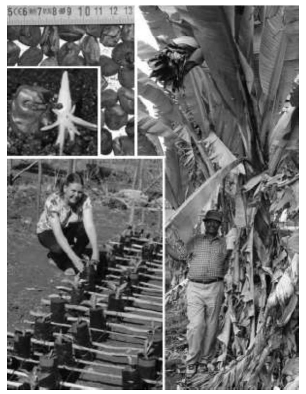
Figure 4. Enset seeds, newly germinated, three week seedlings and 21 months after germination with inflorescence, and the authors.

For the germinated seedlings, growth was very efficient (Figure 4). They grew well in natural local soil but growth was enhanced if given manure as for corm burial.