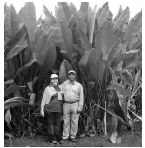
Figure 3. The authors with 4405 enset sprouts from 63 corms, nine months after burial and six months after sprout emergence.

The watered corms did not rotten; instead they emerged earlier (average over the three pre-treatments were 62 days compared to 73) and the sprouts were more equalsized (standard deviation 1.5 \text{ dm}^3 compared to 2.2). Thus, if a farmer has access to a water source, planted enset corms can, without any risk, be given water if unexpected prolonged drought occurs after corm burial for propagation.